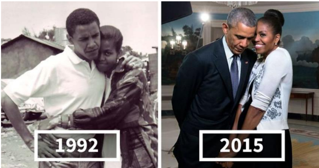
“Michelle and I didn’t come from well-to-do backgrounds. We didn’t have famous families. But it wasn’t just that we worked hard. It was also that somebody made an investment in us. That’s what America did for us.” Barack & Michelle Obama