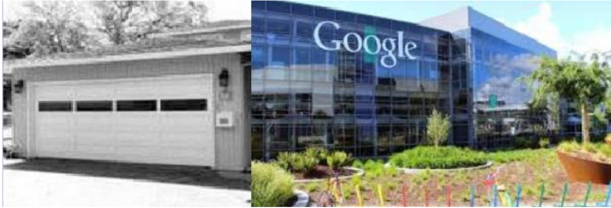
Google's headquarters 1975 vs 2020

Change is real, life is worth it, and your sacrifices, work and fatigue will give you success one day. Go for it, and take it by your own hands, because no one will bring you the thing that you want in life, you got to insist and hustle hard. It is all about your own life and your own belongings. Fight for your little world, your life and your goods because no one will do it for you.